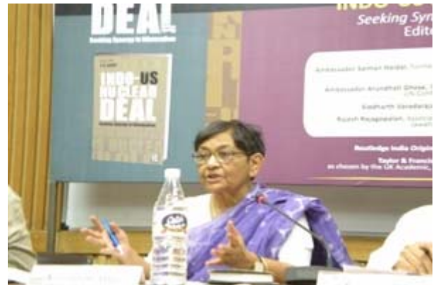
Amb. Arundhati Ghose

There was much sound and fury about the separation plan; it was discussed by India long