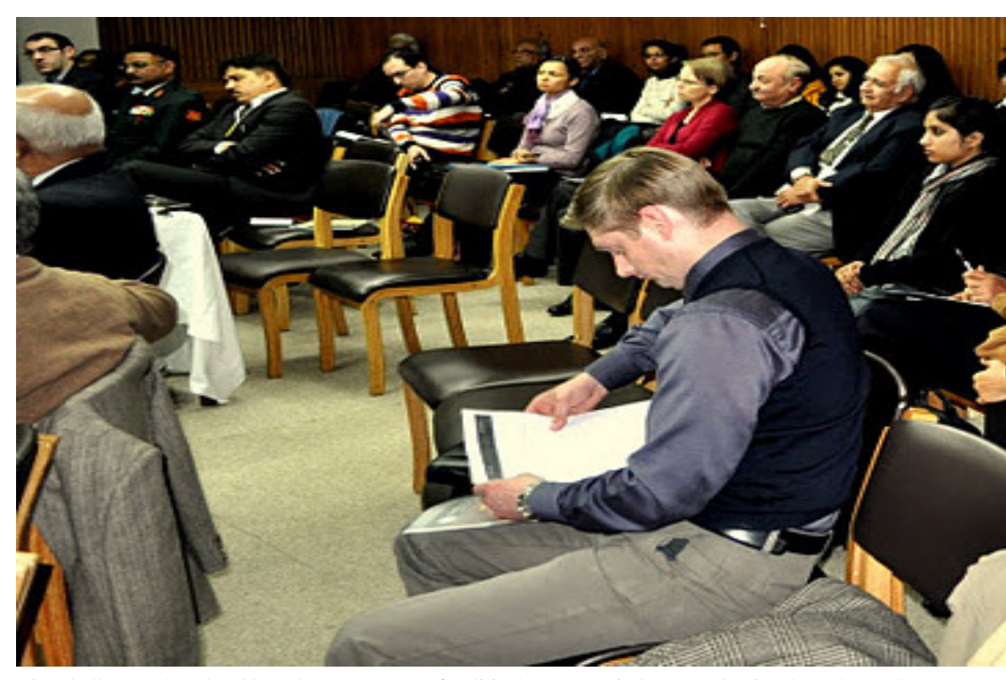
rity challenges that should not become a part of political up-manship because that is where the problem arises.